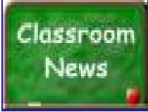
4th, 5th and 6th Grade Spanish Projects